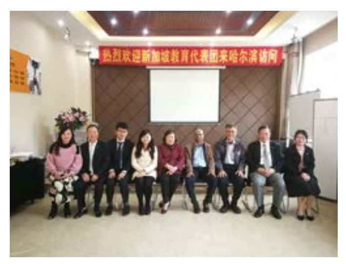
Harbin International Educational Conference

In 2019, we had requests coming in from China for us to share our knowledge on dyslexia and Chinese language support. In October, we presented at the Harbin International Educational Conference with more than 100 attendees with mainly parents, preschool principals and officials from the local ministry of education. In December, we presented at the Shenzhen Children Hospital with more than 100 attendees with a mix of doctors, speech and language therapists and educators. Both presentations were well-received and requested for additional support in the year ahead.