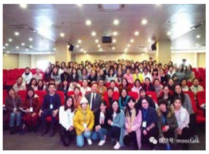
Shenzhen Children Hospital